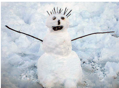
Snowperson & photo courtesy of Scott and Easter Limback.